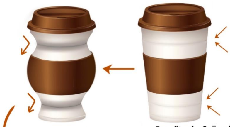
A paper cup with .foldable joints